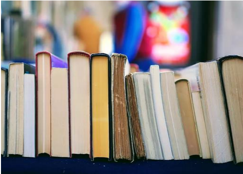
Candace Okin Publishing